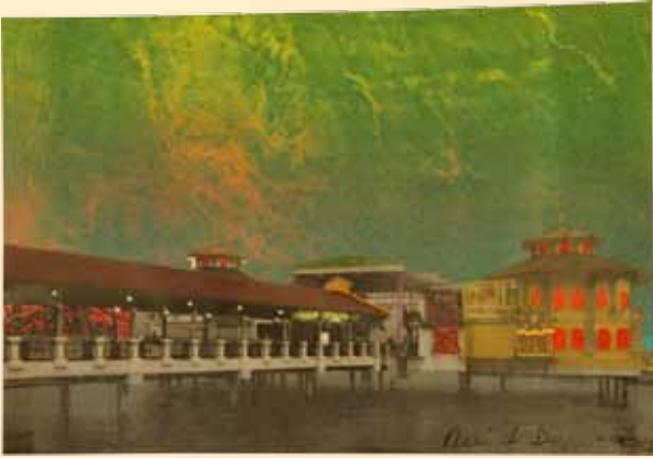
Church Street pier, Tanjung City marina (40.5cm x 27.5cm)