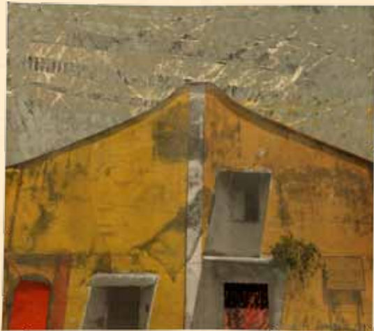
Armenian Street (37.5cm x 32.5cm)