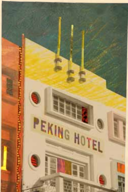
Peking Hotel (27cm x 42.5cm)