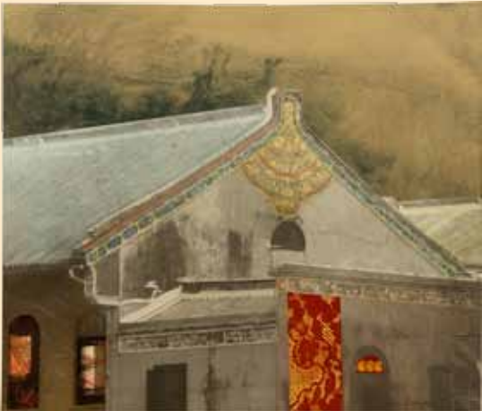
Cheong Fatt Tze mansion (39.5cm x 34cm)