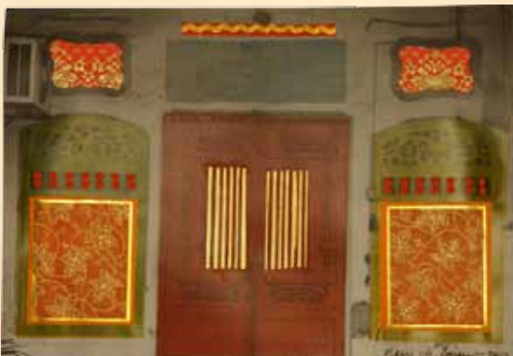
Private mansion, lebu Muntri (40.5cm x 35.5cm)