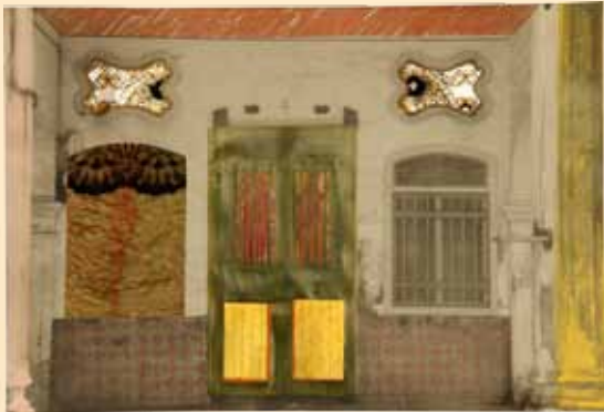
Stewart Lane (39cm x 30cm)