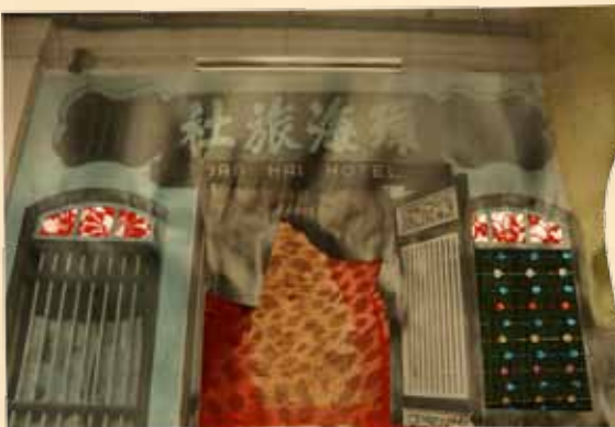
Wan Hai hotel, Love lane (40.5cm x 27.5cm)