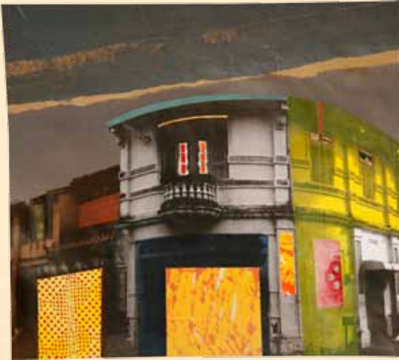
Lebuh Cannon (39cm x 35cm)