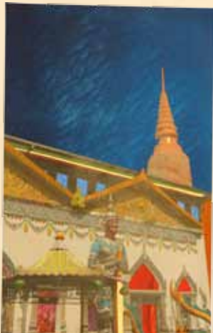
Reclining Buddha temple (27cm x 42cm)