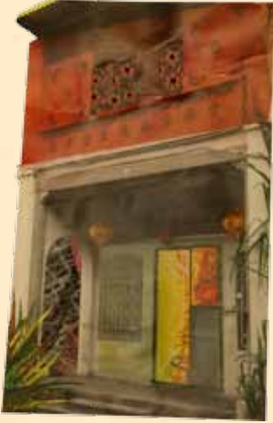
Tye Clan association (26cm x 40.5cm)