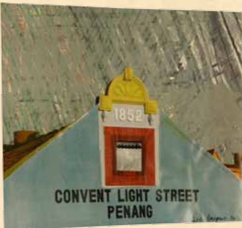
Convent Light street (41cm x 33.5cm)