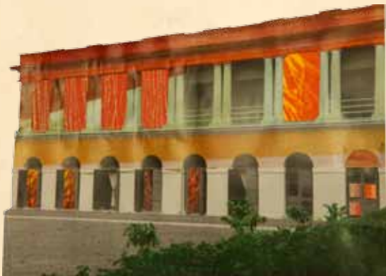
Suffolk House, jalan Ayer Hitam (39.5cm x 28cm)