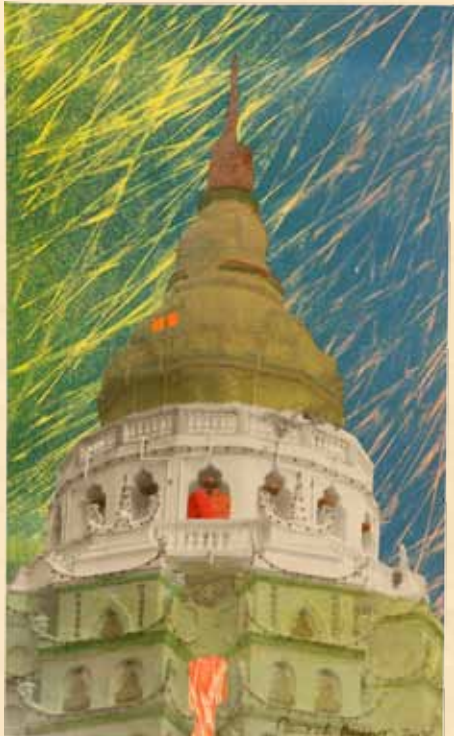
Kek Lok Si temple (26.5cm x 44cm)