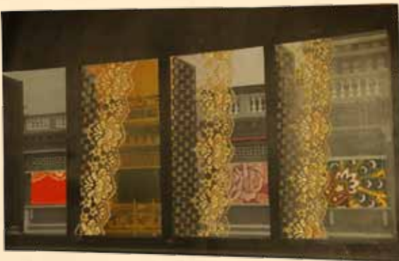
Yap temple, Armenian street (41cm x 27cm)