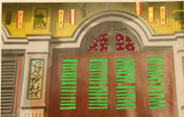
Shuttered mansion (40.5cm x 25.5cm)