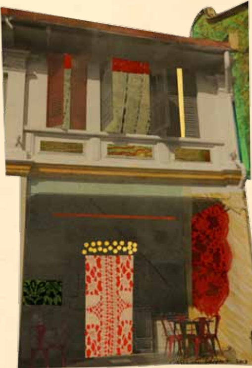
Ryokan hostel (28cm x 41cm)