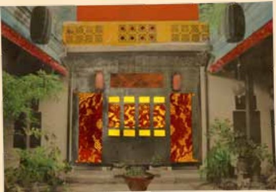
China Street mansion (40.5cm x 28cm)