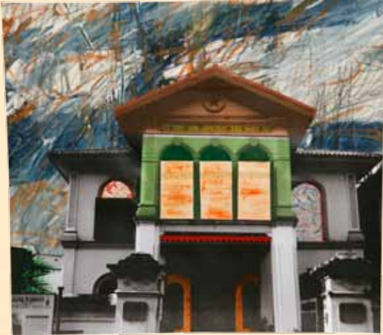
Syed Alattas mansion (37cm x 32cm)