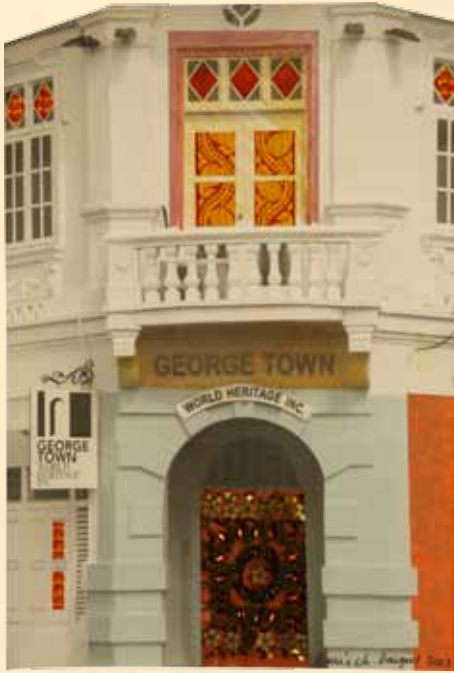
George Town world heritage (28cm x 41cm)