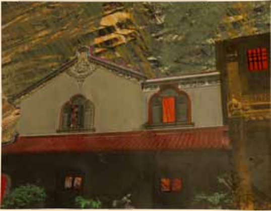
Blue Mansion (40.5cm x 31.5cm)