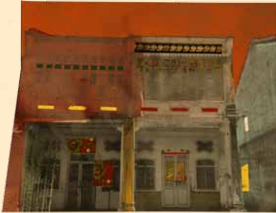
Stewart lane houses (40.5cm x 28cm)