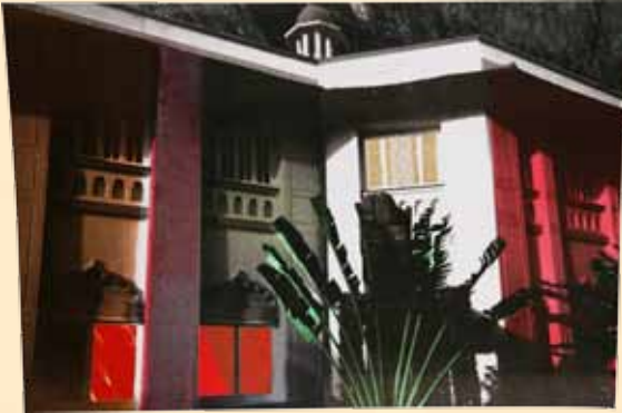
E&O Hotel (39cm x 28cm)