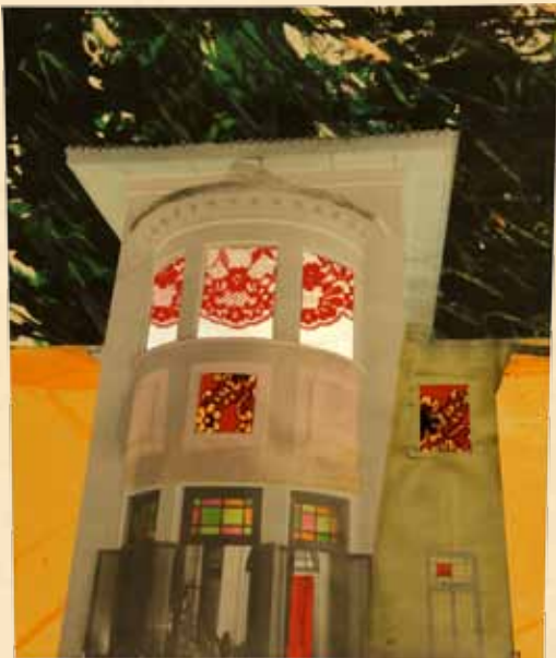
Perut Rumah, kelawai Rd (31.5cm x 38.5cm)