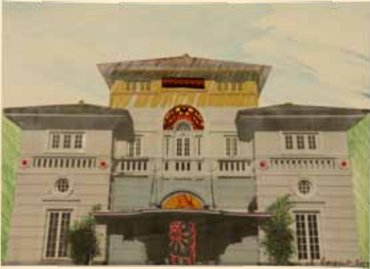
32 @ the mansion (39.5cm x 28cm)