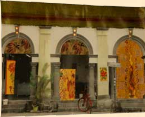
Lum fong bar and hotel,leboh Muntri (40cm x 27cm)