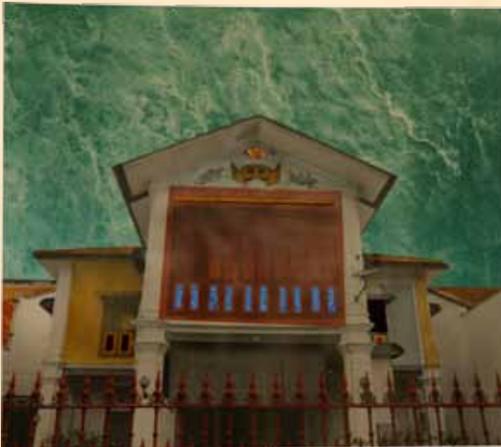
Private mansion (40cm x 27.5cm)