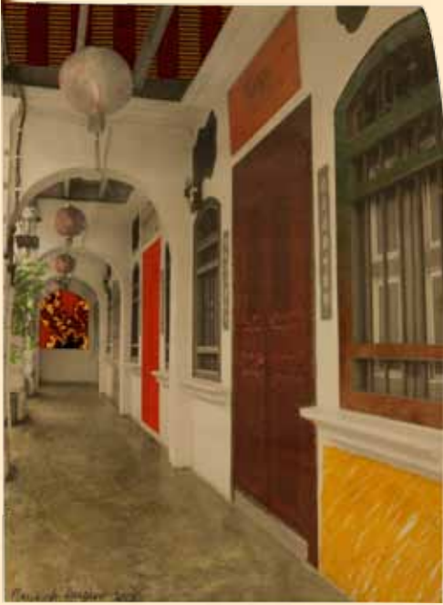
Lorong Stewart (28cm x 38cm)