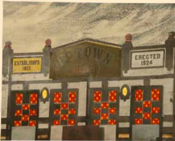
Uptown bistro, jalan Sultan Ahmad Shah (39cm x 31cm)