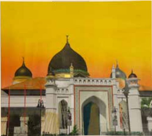
Kapitan Keling mosque (37cm x 33cm)