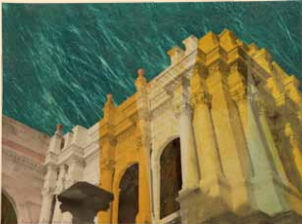
City Hall (40cm x 29.5cm)