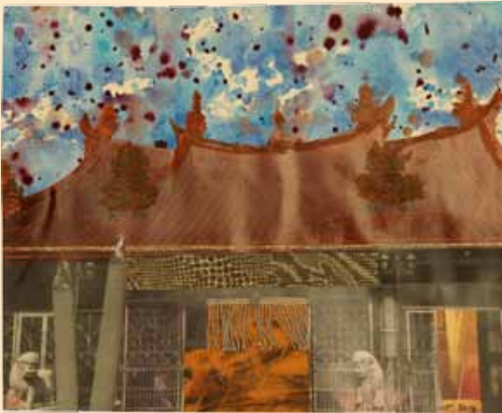
Kuan Yim temple (40.5cm x 33cm)