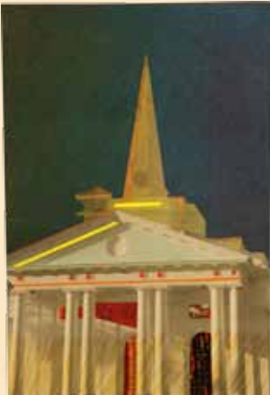
St George's church, Farquhar Street (27.5cm x 42cm)